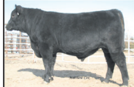
Mill Bar In Focus 5018 Sire: In Focus MGS: GAR Grid Maker

115 Power-Packed, Performance-Tested, Carcass Evaluated Bulls Big, stout, January and February yearlings. Sons of: Schurgene MC 2500, E&B Precision 1023, Mytty In Focus, OCC Emblazon, Boyd On Target, GAR Grid Maker, Sitz Tradition, SAV 8180 004, Sitz Alliance 6595. Mill Bar will keep and feed your bulls until April 1, 2008, at no charge and deliver to adjoining states after having them fertility tested in March.