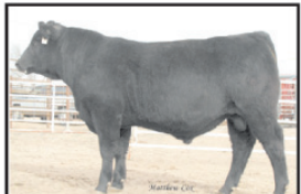
Mill Bar MC 2500 5036 Sire: MC 2500 MGS: BCC Bushwacker 41-93

Tri-State Livestock Auction, McCook, Nebraska 300 Angus Sell