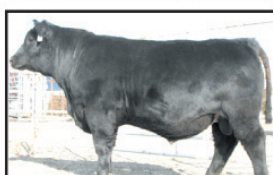
Mill Bar Precision 1023 5062 Sire: Precision 1023 MGS: Alliance 6595