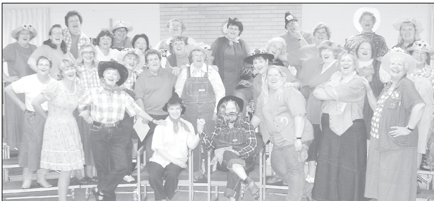
WINDSONG CHORUS is made up of women from Colorado, Nebraska and Kansas. They will be singing on Sunday.