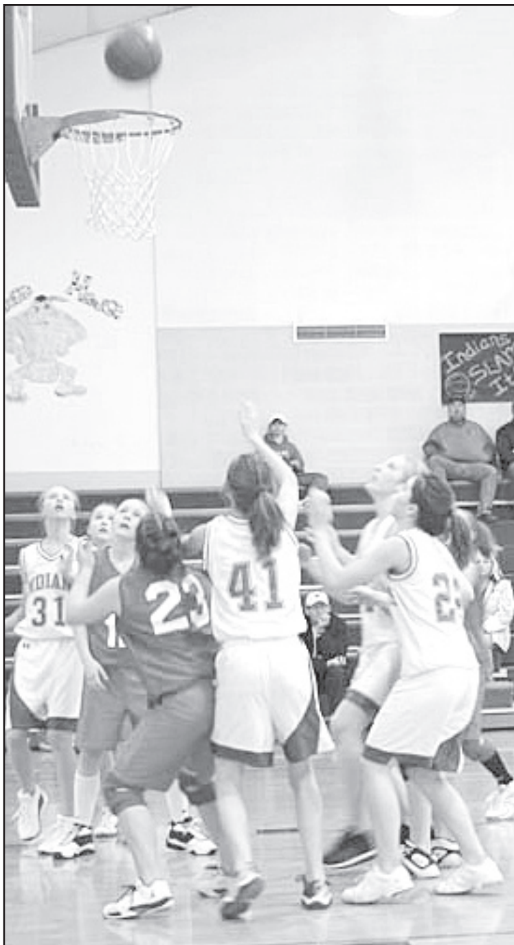
THE JUNIOR HIGH teams are playing hard. On Thursday they met Oakley.

Teams attending and the schedule of events will be published next week.