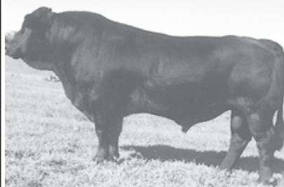
Brooks Above Par

Selling 5 sons of this Homozygous Black Homozygous Polled powerhouse