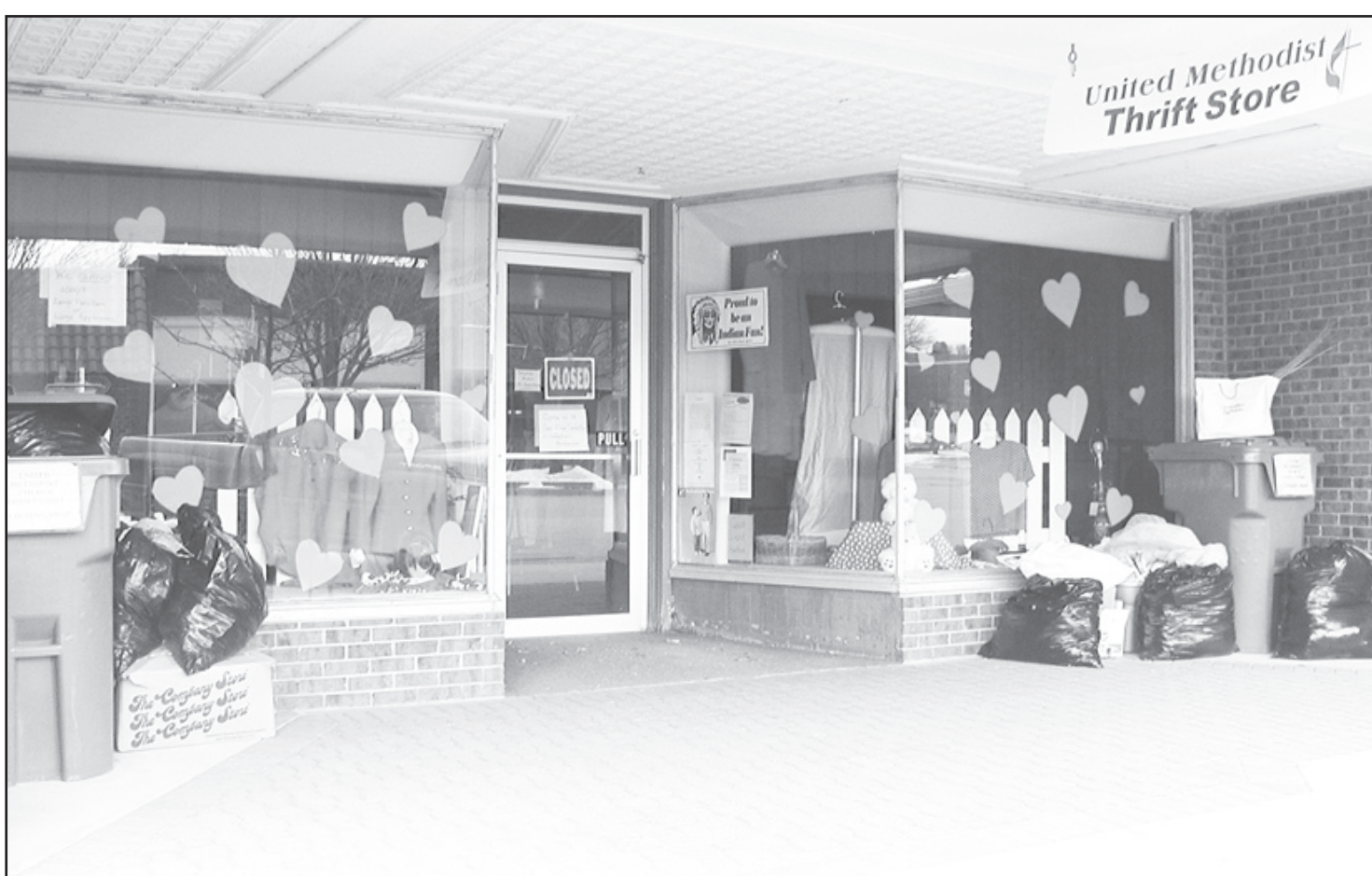
CLEANING OUT CLOSETS — From the looks of the thrift store over the weekend, it was a good time to clean out all those unwanted clothes.

These meetings are limited to female alcoholics to provide an opportunity for members to share with one another on problems related to drinking patterns and attempts to achieve stable sobriety. They also permit detailed discussion of various elements in the recovery program.