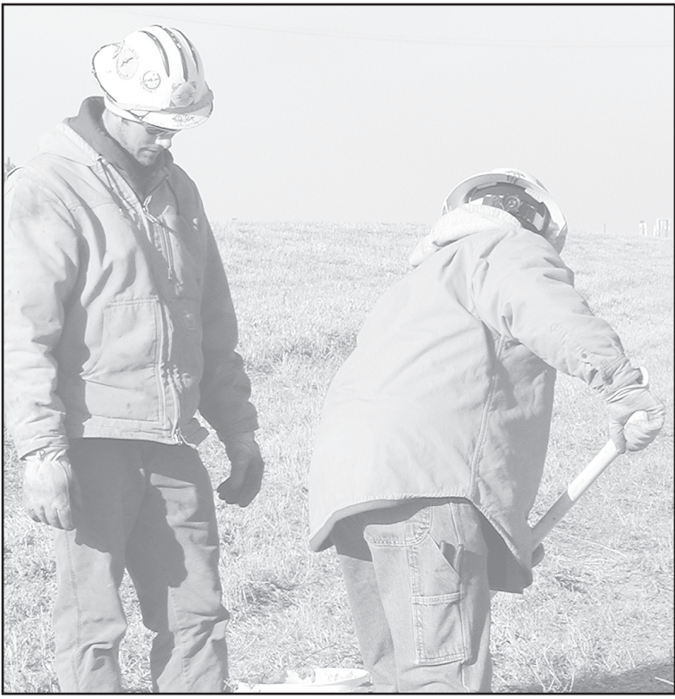
WORK CREW REPLACES power poles that were damaged in past ice storms.

Midwest contracted PAR Electrical Contractors out of Kansas City, Mo., to do the work. There have been times when