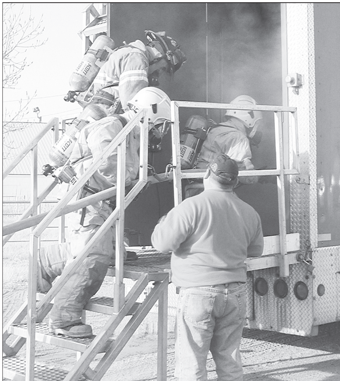
ONE OF THE TRAINERS makes sure the men are ready to enter the training trailer.