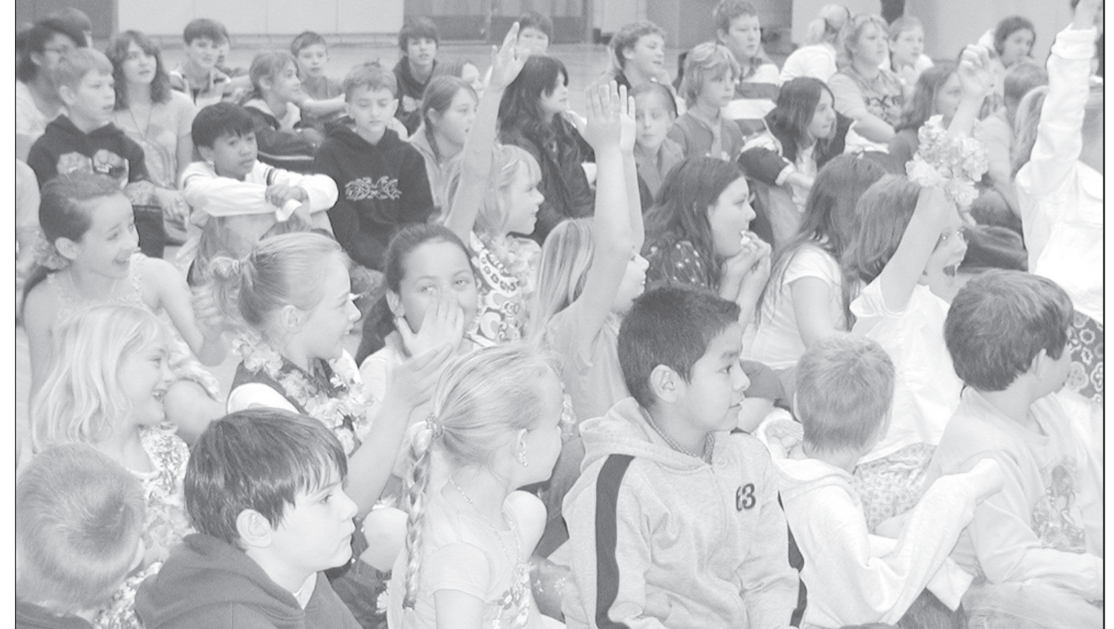
SECOND GRADE STUDENTS were excited when it was an- The students were the top winners in the grade school. nounced that they had raised almost $170 for to fight cancer.