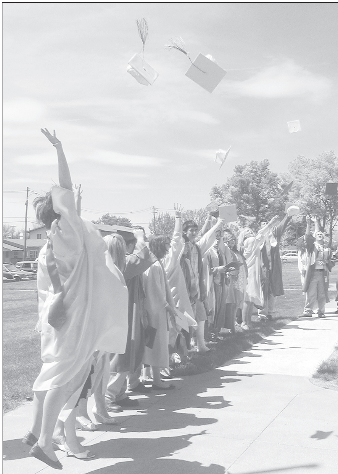
UP AND AWAY — Seniors threw their caps in the air following the graduation ceremony.