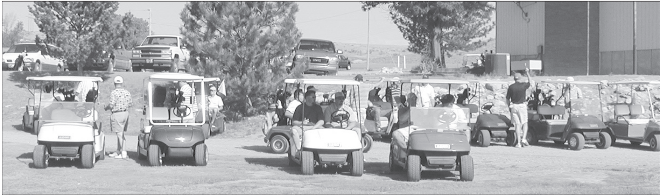
THIRTY TEAMS OF GOLFERS are waiting for the starting gun Saturday morning at Riverside. The two-day event was played in nice weather.