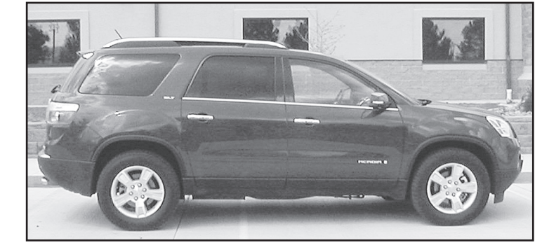
2008 GMC Acadia, Red, Leather, Heated Seats, DVD Player, AWD