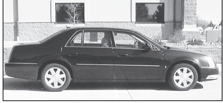
2006 Cadilliac DTS, Blue, Leather, Heated and Cool Seats