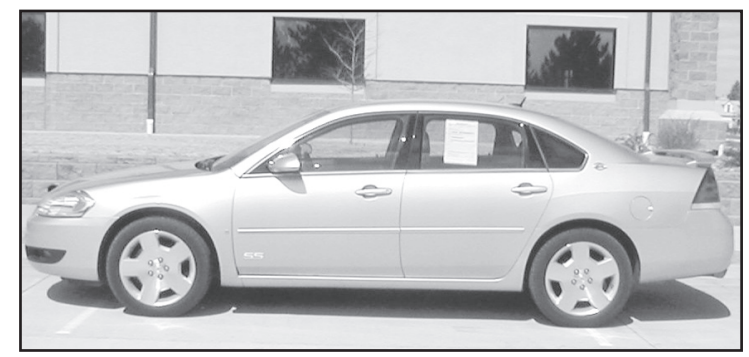
2008 Chevy Impala SS, Silver, Leather, Heated Seats, XM Radio

2003 Chevy EXT-Cab, Black, Leather, Heated Seats, XM Radio