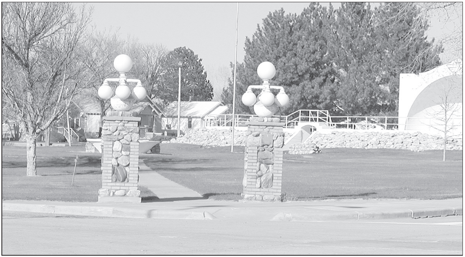
Sawhill Park — 2008

"I thought it would be awesome to make the run," he added.