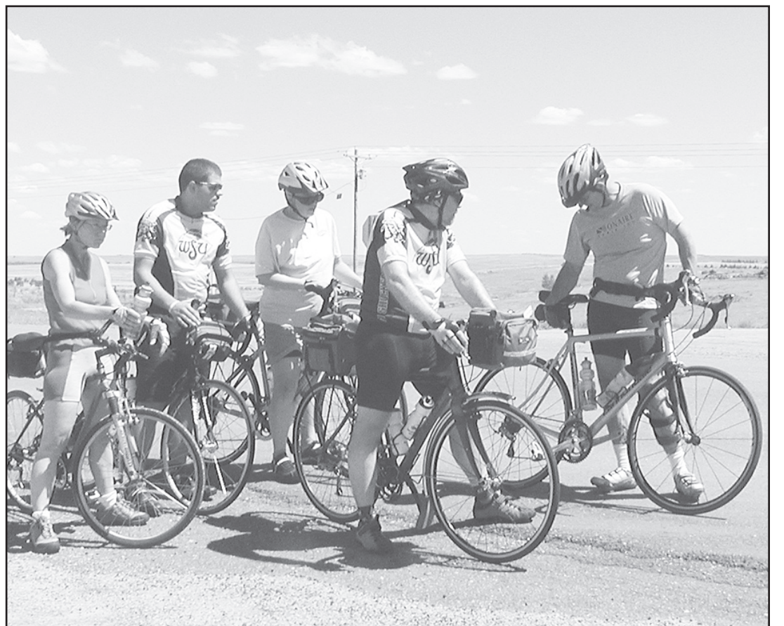
CYCLISTS TAKE A BREAK to check over their equipment to make sure everything is in good working order before setting out on the next leg of their journey.