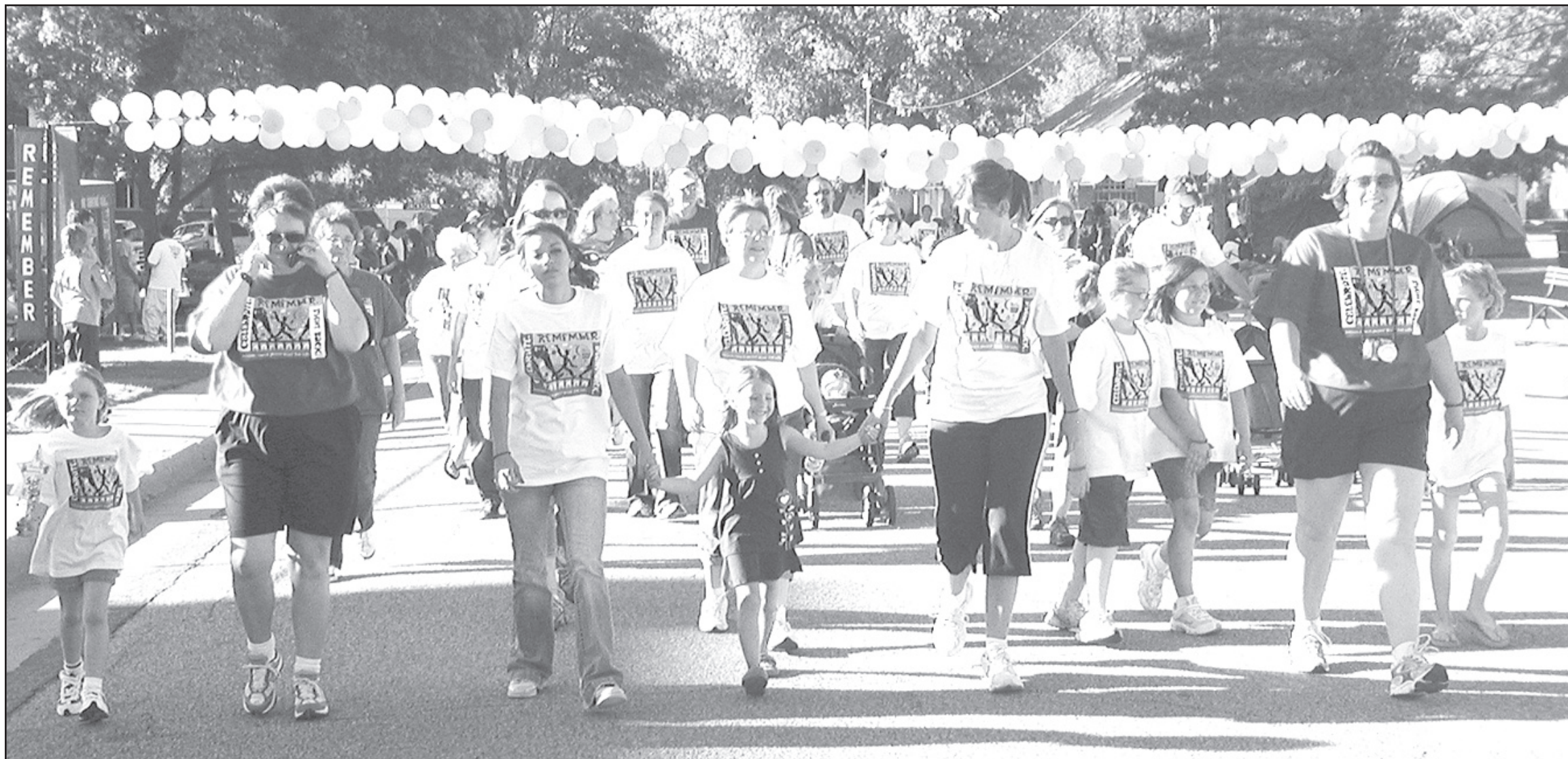
THE BRACELIN team had 51 walkers participate during the Relay for Life. The Relay started Friday night and ended early Saturday morning.