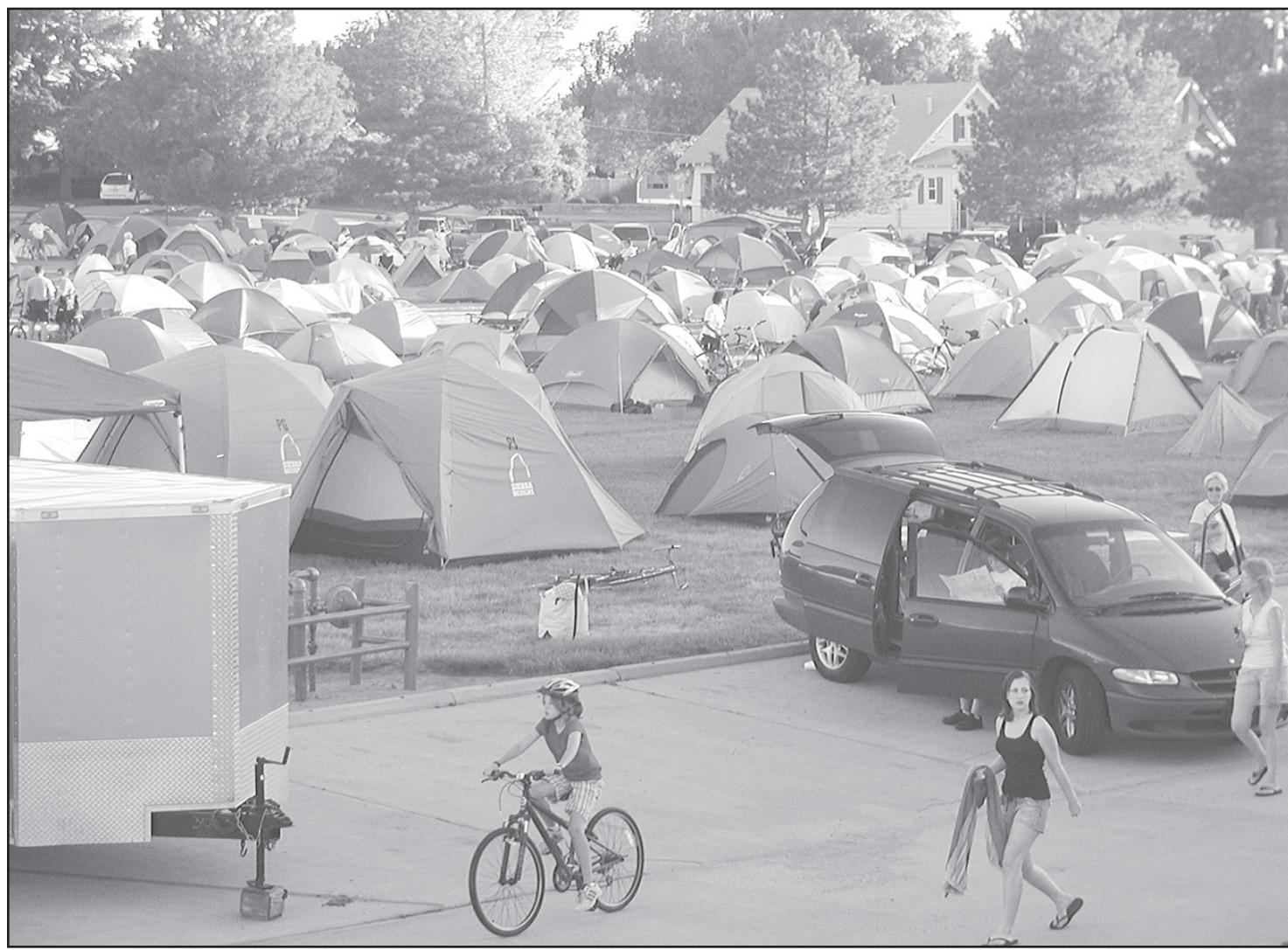
TENTS, TENTS AND MORE TENTS — Greene Field looks like a crowded campground with the bikers in town.