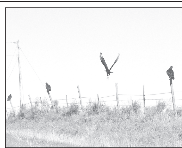
THEESE Turkey vultures found a good place to rest north of town.

Arrangements by Knodel Funeral Home, St. Francis.