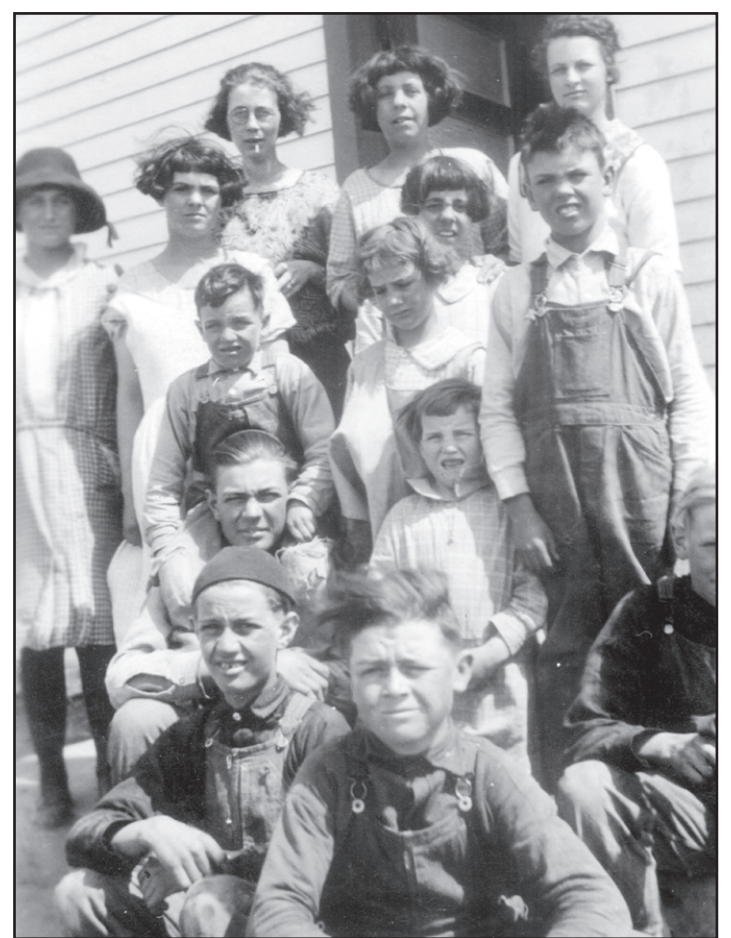
THE 2008 THRESHER QUEEN was in first grade posing with her fellow classmates at the country school she attended. There could be anywhere from three to 15 pupils at a time. Attending church with her neighbors and friends are special memories for her.

People are welcome to visit the many buildings filled with articles used in the past. There will be demonstrations, new items to see and other activities. The swap meet will be held on the grounds. This is an attraction that draws collectors looking for certain items.