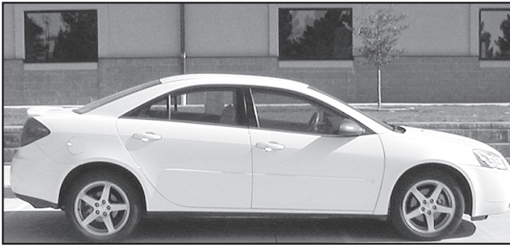
2007 Pontiac G6, White Cloth, CD Player

We Have A Great Selection of Pre-owned Vehicles in Stock now.