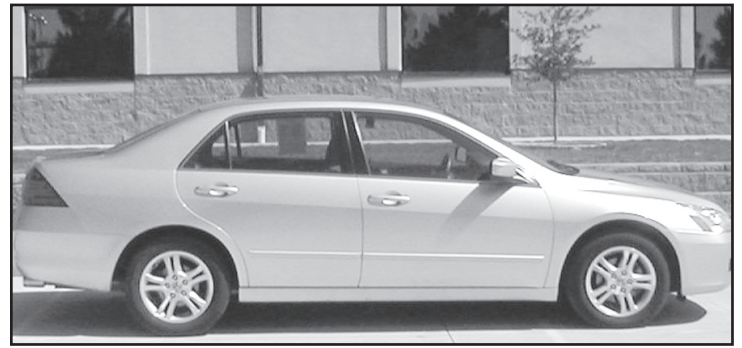
2007 Honda Accord, Silver, Cloth, CD Player