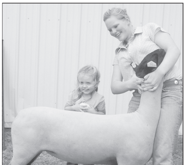
shows her prize winning ewe to a future 4-H'er.