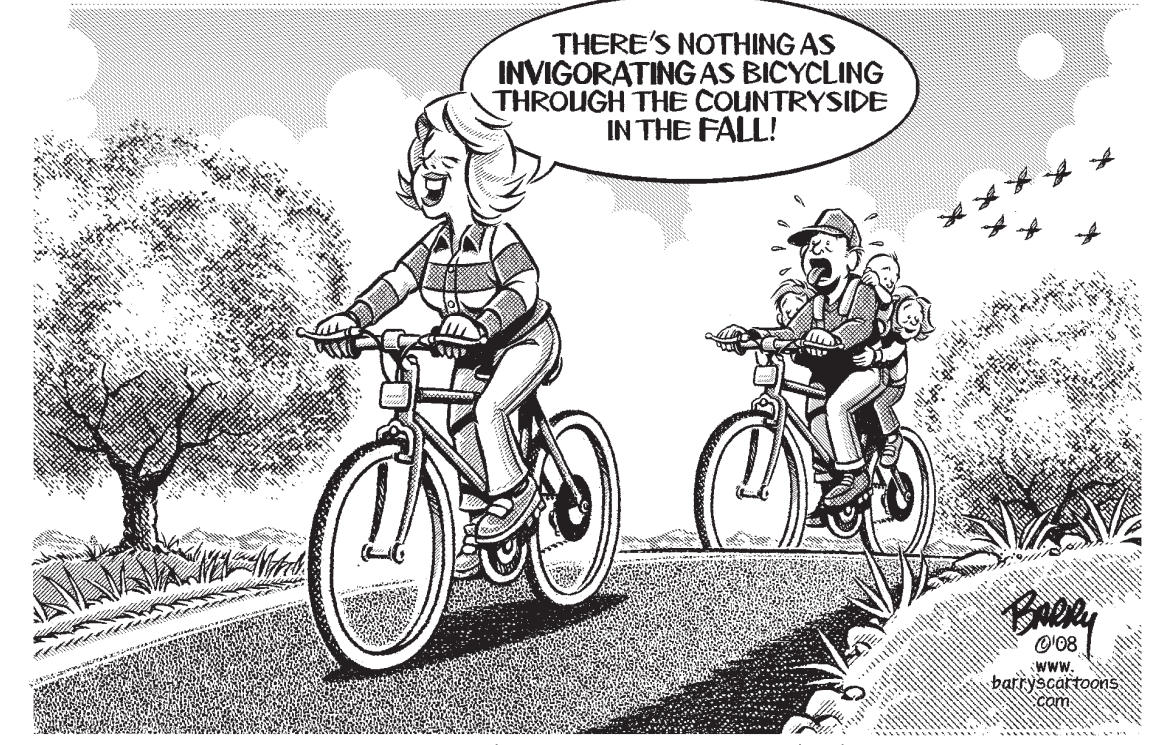
MOM EXERCISES HER LEADERSHIP SKILLS ON A FAMILY OUTING ...