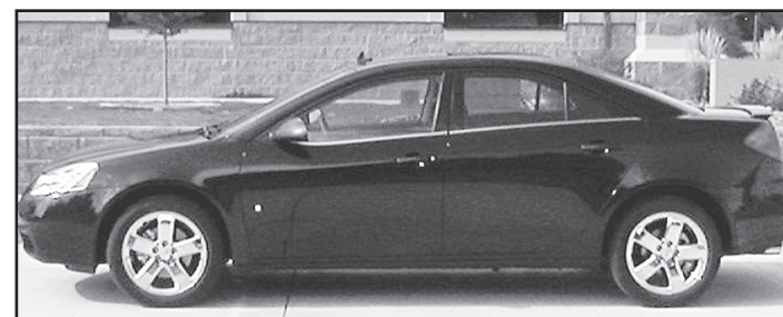
2009 Pontiac G6, Midnight Blue