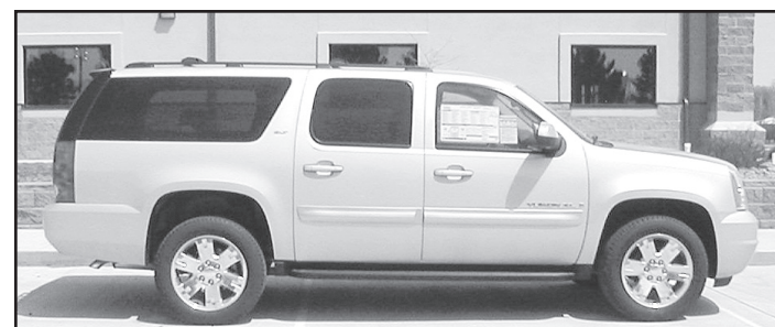
2008 GMC Yukon XL, Gold Mist