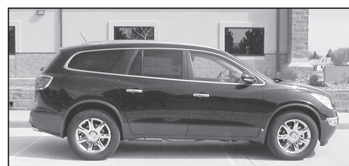
2008 Buick Enclave, Carbon Black Met.