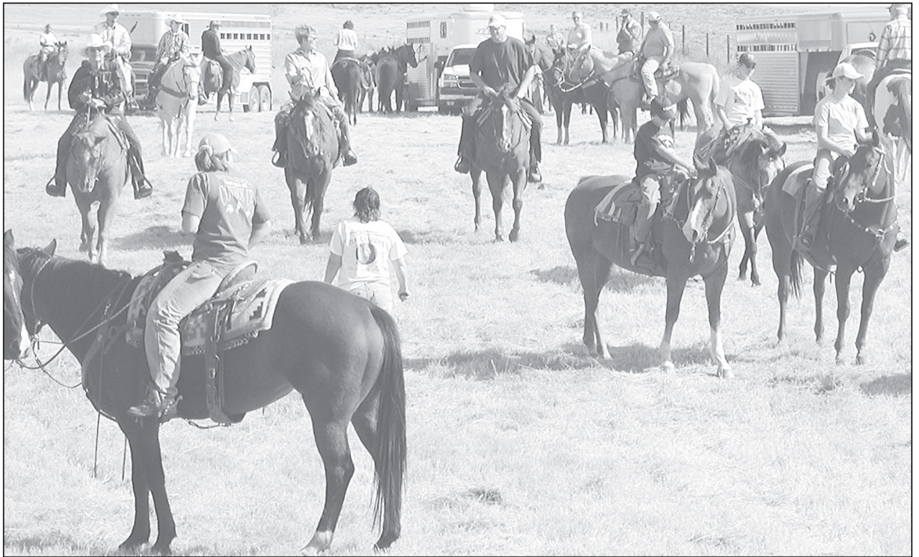
OVER 80 HORSEMEN gathered for the annual trail ride held north of St. Francis on Sunday afternoon.