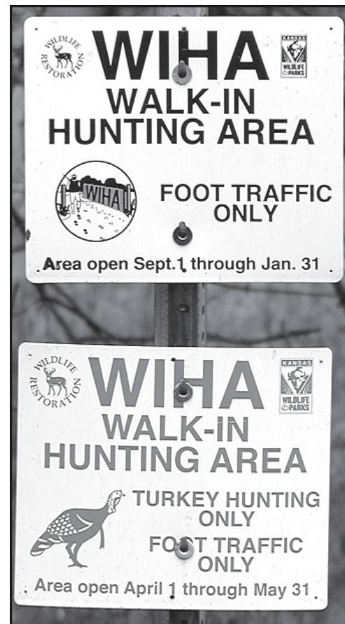
These signs show hunters where the walk-in hunting area is at Sappa Park, east of Oberlin, in Decatur County.

Money for the Walk-in Hunting Area program comes from a combination of hunting license fees and Federal Aid to Wildlife Restoration.