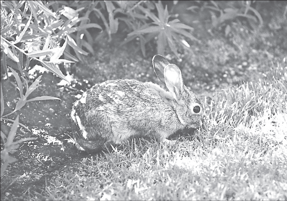
Rabbits have been a popular hunting species for centuries on the plains.