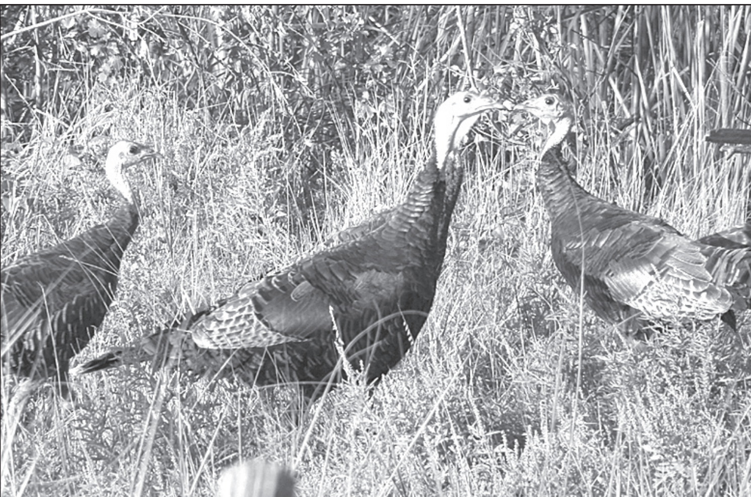
Two wild turkeys in Sherman County check each other out. Turkeys like these were reintroduced into the state in the 1960s.