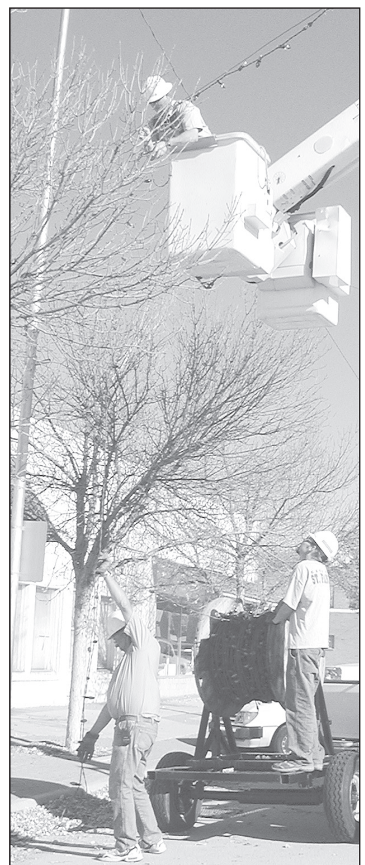
IT'S BEGINNING to look a lot like Christmas. The city crew is busy hanging the lights on Main Street.