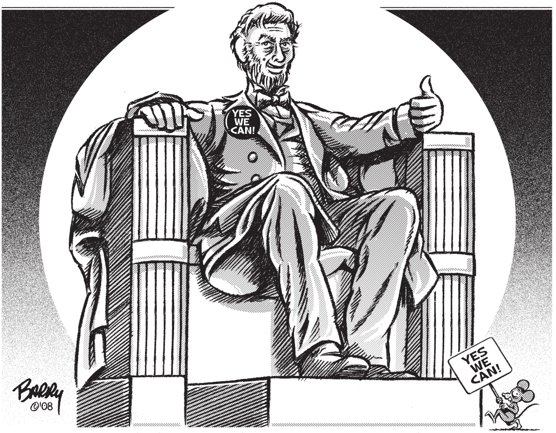
OBAMA OFTEN READS LINCOLN FOR INSPIRATION ...