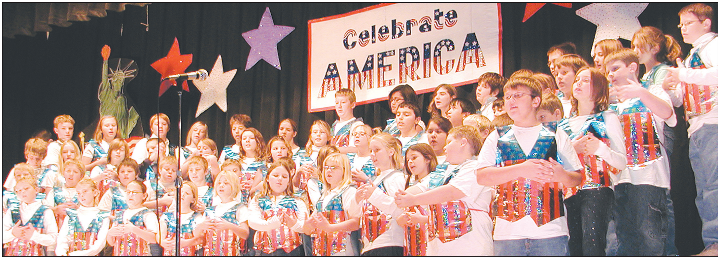
ST. FRANCIS fourth, fifth and sixth graders honored the country's vets on Monday. This is an annual event attended by vets from around the area.