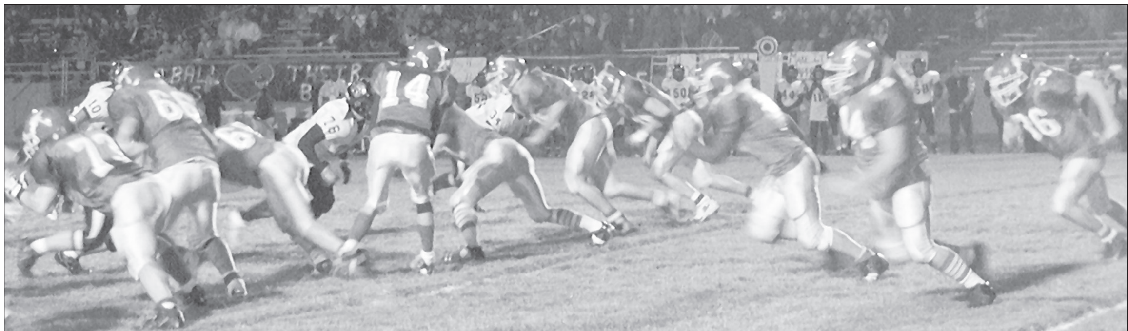
TWO GOOD FOOTBALL TEAMS, St. Francis and LaCrosse met at Greene Field in regional football action on Saturday. Although each team had the advantage, at some point in the game, LaCrosse was the winner by one touchdown 38-30.