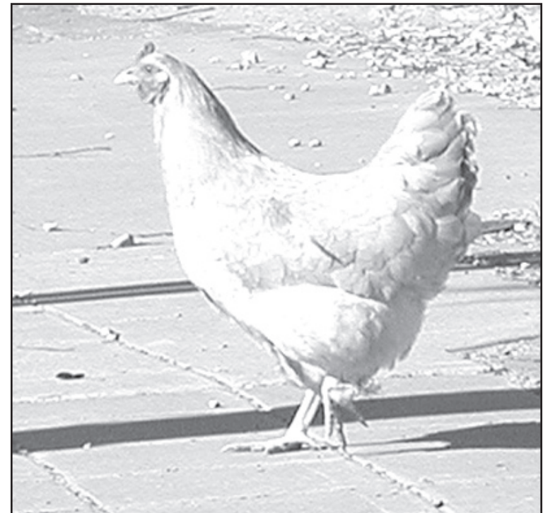
Goldie had some shopping to do while she was in town.

People have until the weekend of Dec. 13 and 14 to get their