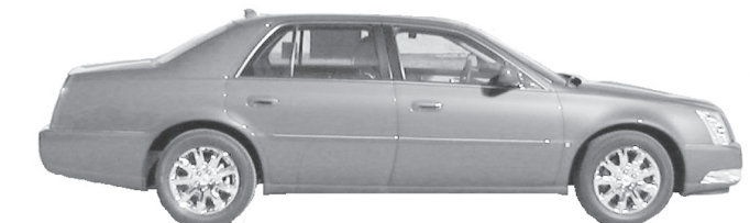
2009 Cadillac DTS, Crystal Red