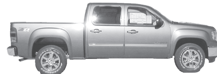
2009 GMC 1/2 Ton Crew Cab, Steath Gray