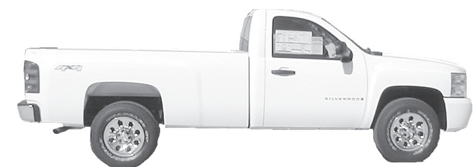
2009 Chevy 1/2 Ton Reg. Cab, White