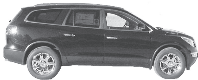
2009 Buick Enclave, Dark Crimson