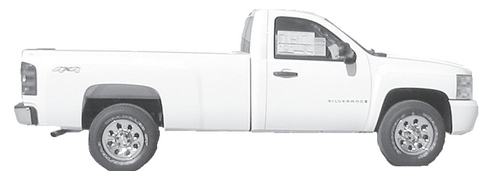
2009 Chevy 1/2 Ton Reg. Cab, White