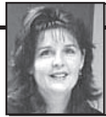
By Mila Bandel County Health Nurse

National Influenza Vaccine Week runs from Dec. 8 through Dec. 12.