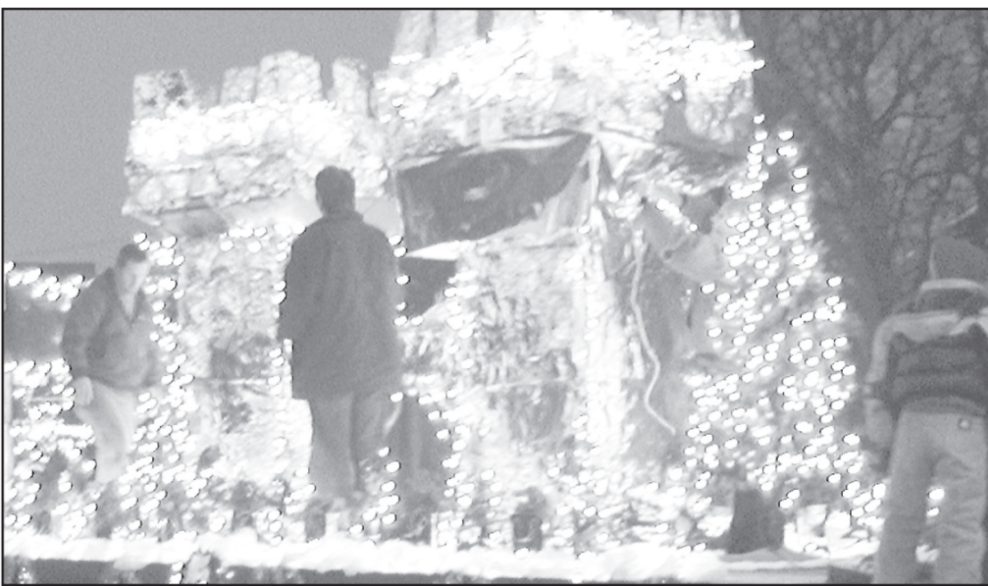
See IDEAL on Page 10A PLEASANT HILL 4-H Club had the winning Light Parade float.

The St. Francis Christmas Opening always finds people talking to old friends and neigh-