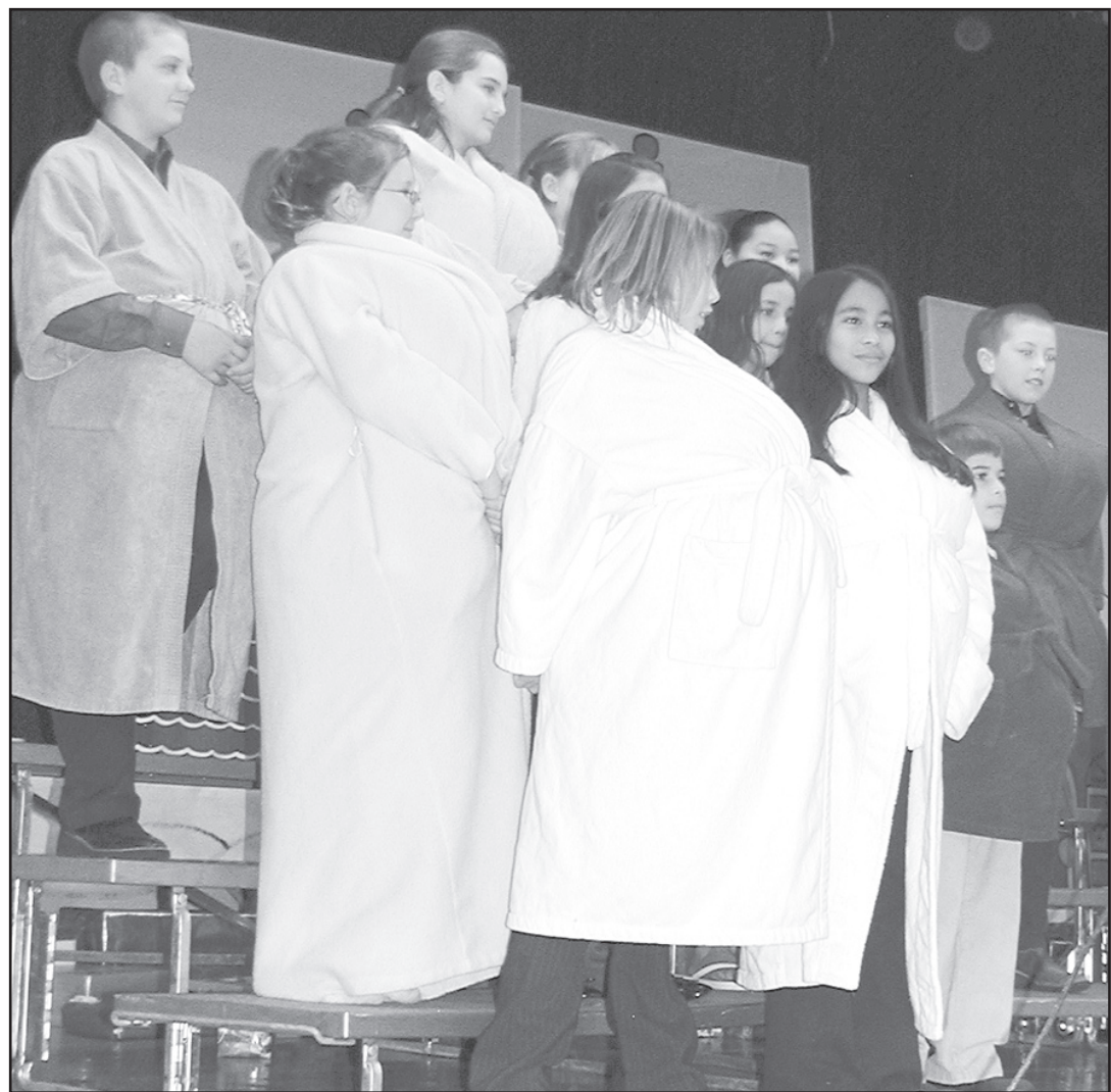
FIFTH AND SIXTH GRADERS performed at the Senior Dinner, "Christmas is coming and we are getting fat!"