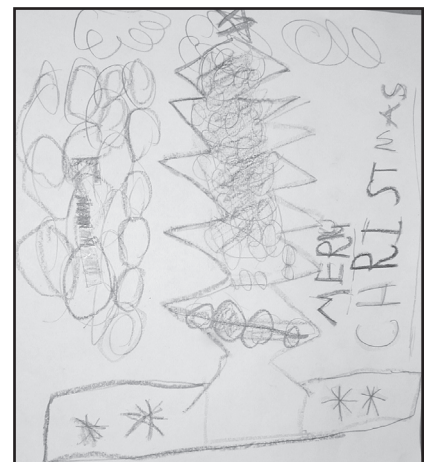
Jesse Baxter ~ Kindergarten