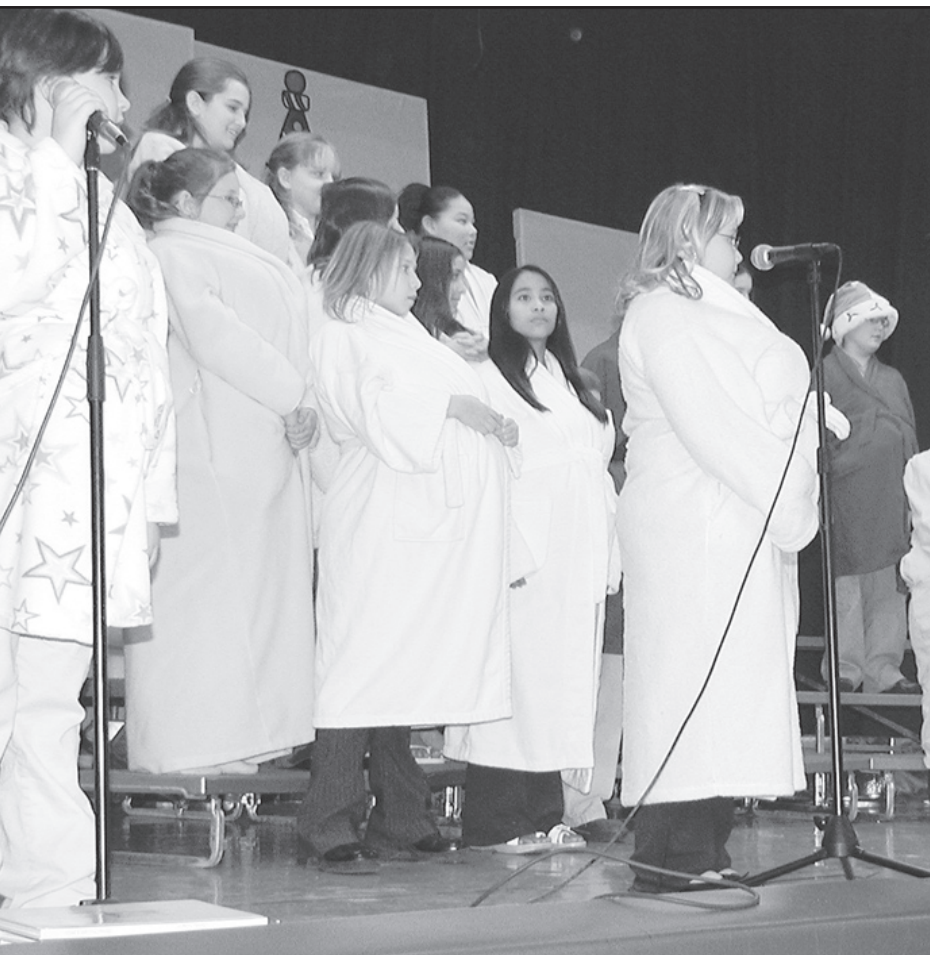
CHEYLIN STUDENTS put on a program during the Senior Christmas dinner.

It is the Christmas season and every small boy and girl has something to say to Santa Claus about what presents they want, and how good each has been.