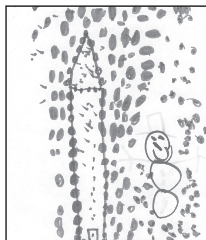
Gabreila Gutierrez ~ Kindergarten