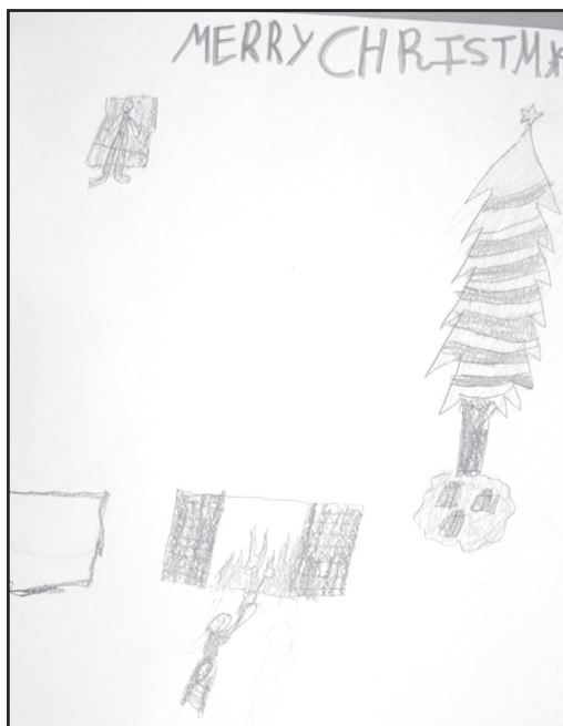
Shakotah Blanka ~ 6th Grade

As the season of celebration approaches, we'd like to extend our warmest wishes to all our good neighbors!