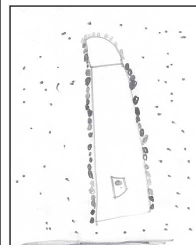
Rob Ceballes ~ Kindergarten