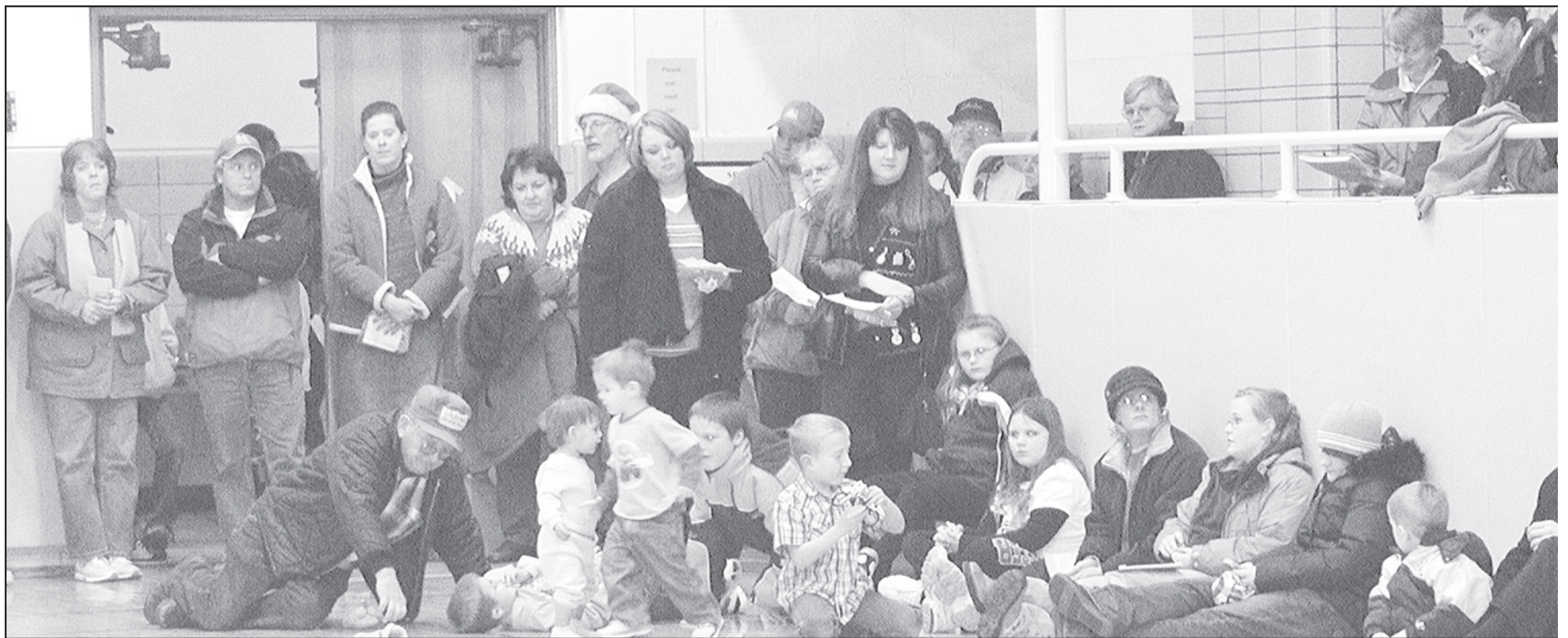
COLD TEMPERATURES found a large crowd gathered in the grade school gym for the drawing. Many were standing or sitting on the floor after the seats were filled.