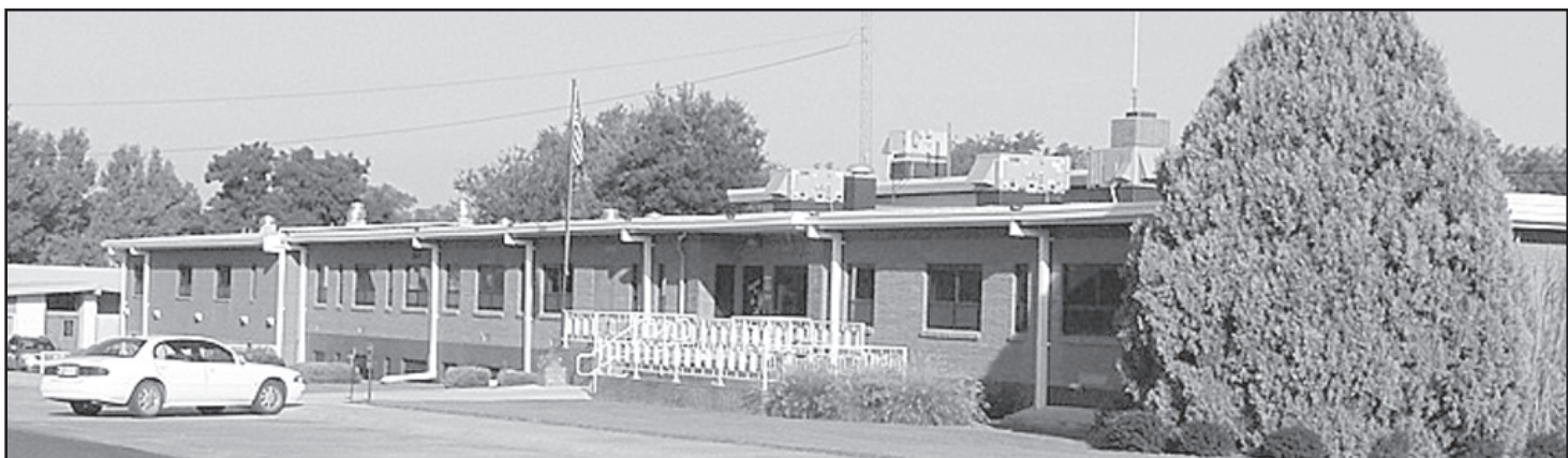
Cheyenne County Hospital