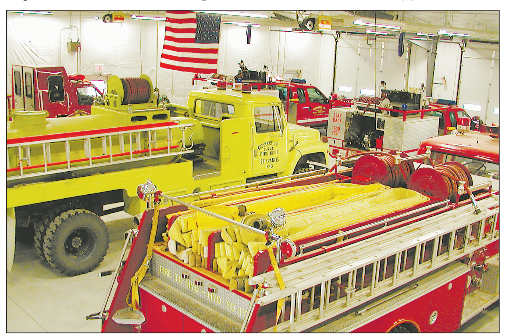
FIRE TRUCKS are in their new home and ready to roll when a call director moved in right after the first of the year. comes in. The firemen, emergency medical service and emergency

An open house is planned for later. However, people are welcome to stop by the building when it is open and there will probably be someone to give a