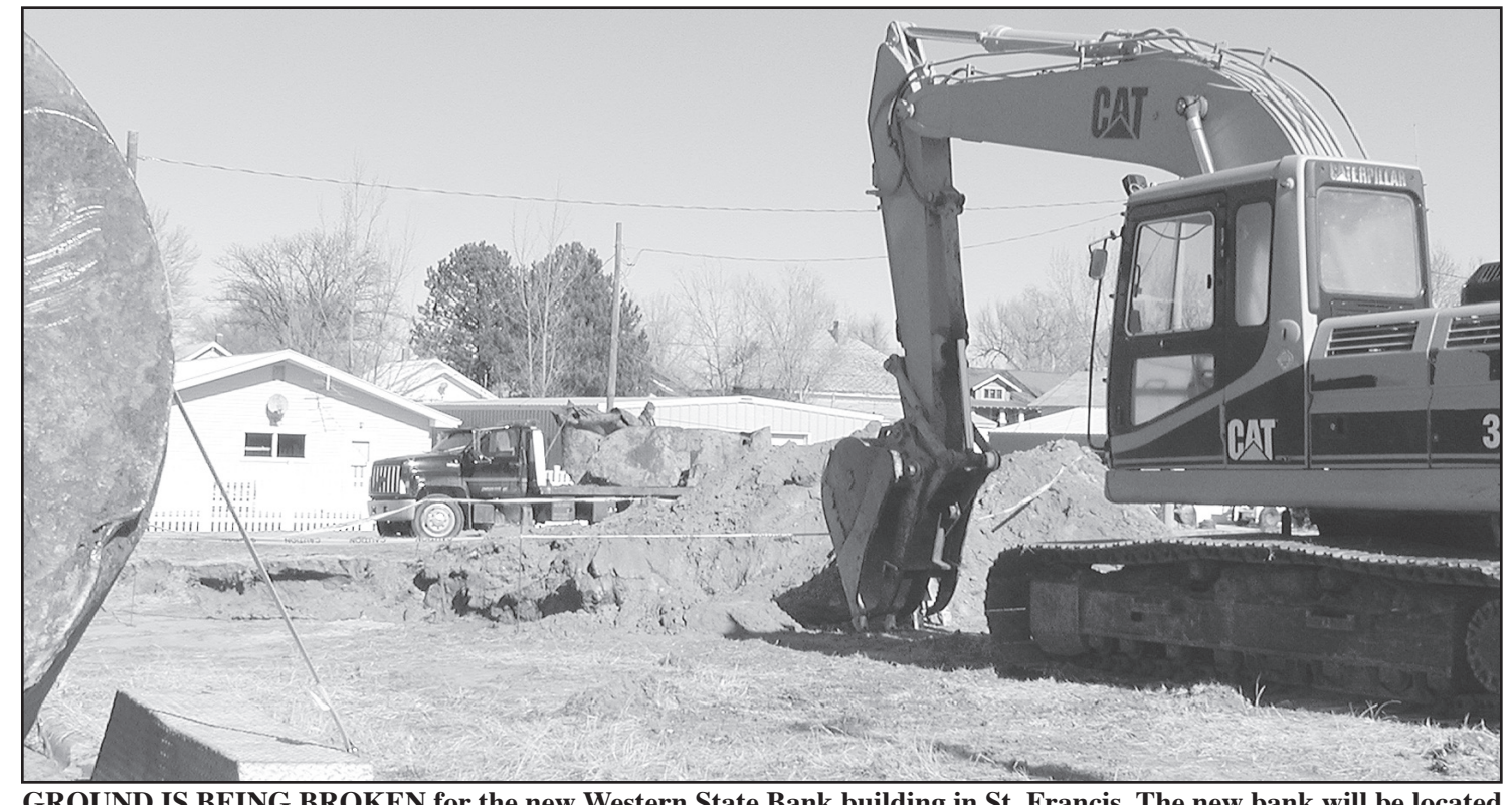
GROUND IS BEING BROKEN for the new Western State Bank building in St. Francis. The new bank will be located at the corner of Washington and Francis Streets

Saint Francis Herald 3A Thursday, February 5, 2009