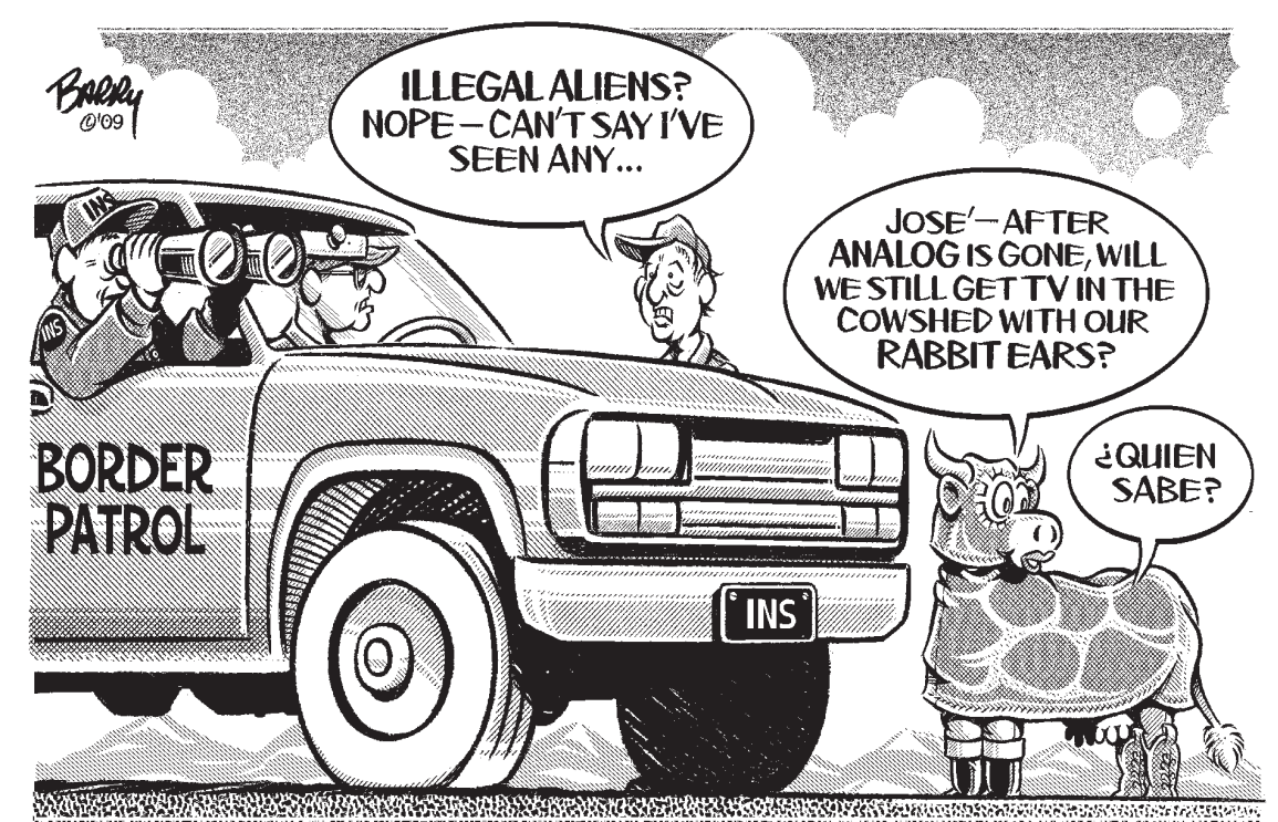
THE SWITCH TO HD-TV IS CONFUSING FOLKS IN SOME QUARTERS...