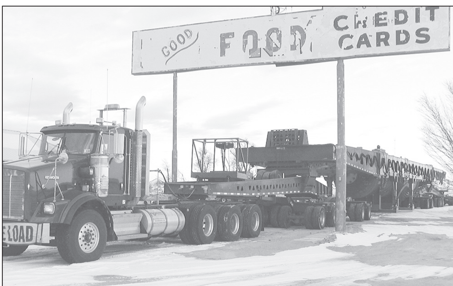
This large piece of equipment was parked at Captain Hook's restaurant in Wheeler on Sunday. No one was around to talk about the equipment but the information on the side of it said it was part of the Scotford Upgrader Expansion program. The program is part of the Athabasca Oil Sands Project Expansion 1, which will add approximately 100,000 barrels per day of capacity of the bitumen mining and upgrading facilities. The equipment weighed 111,100 KGS

The next meeting of the school board will start at 8 p.m. on Monday, March 9, in the library at the high school.