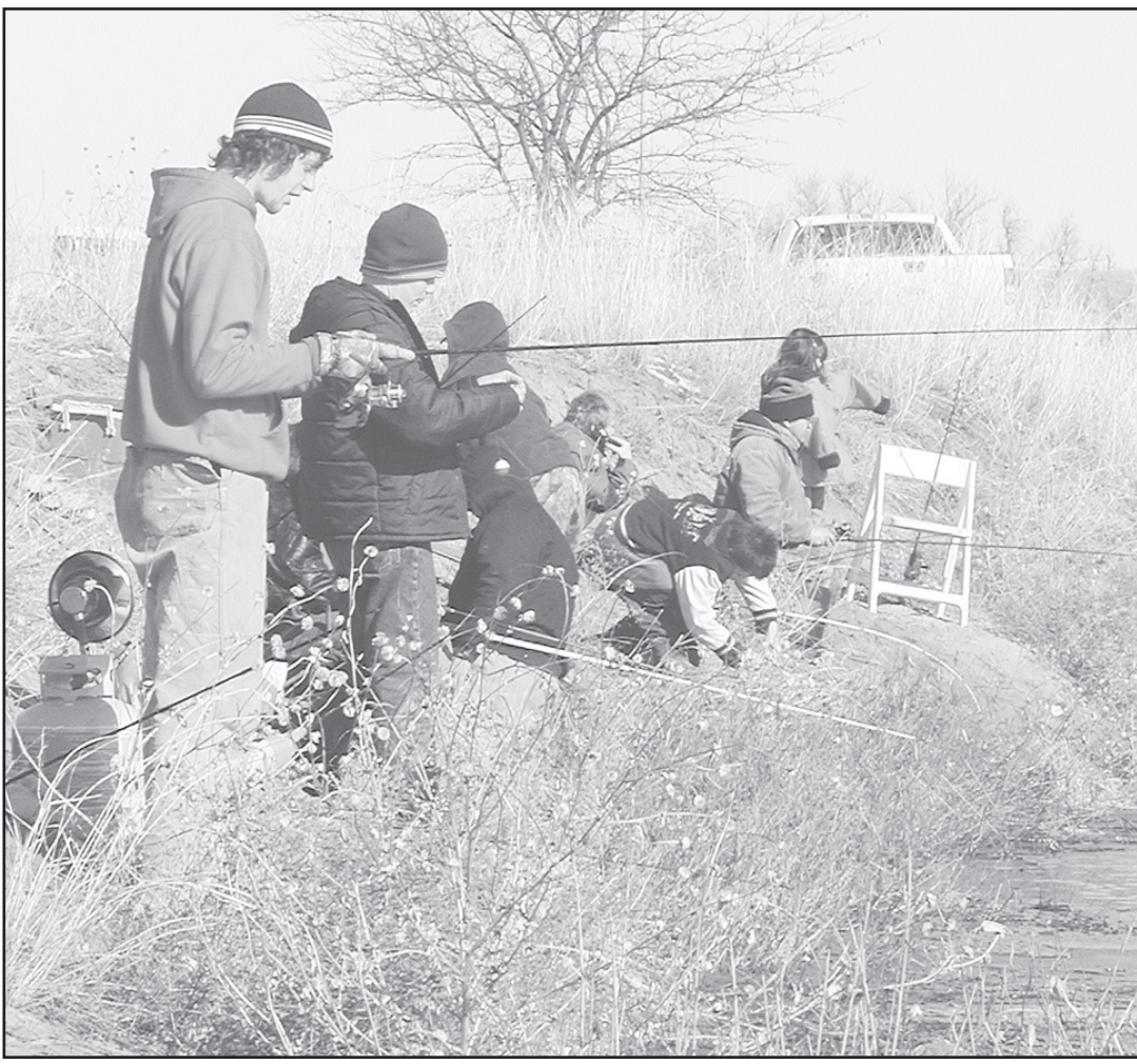
DESPITE THE COLD WEATHER lots of people were at Keller Pond for the fishing tournament held on Sunday.