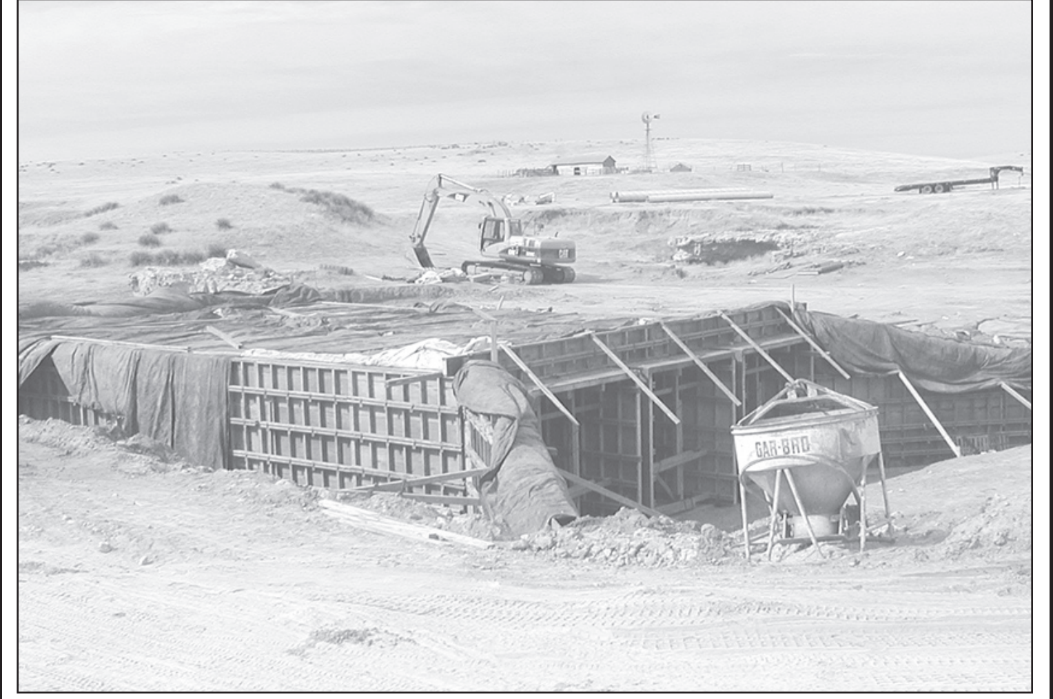
CONSTRUCTION IS NOW TAKING PLACE at the Runzel Bridge, west of St. Francis.

Additional information, the forms are located on the Kansas Natural Resources Conservation Service Conservation Innovation Grants Web page http://www. ks.nrcs.usda.gov/programs/cig/ index.html and at Grants.gov.