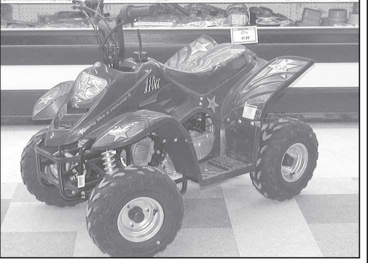
Rock Star Energy Drinks Junior Size 4-Wheeler, gas power, 110 cc