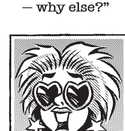
JOE JOBLISS EX-MAIL SORTER