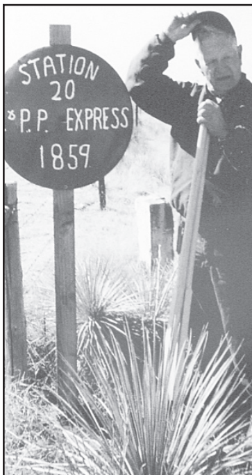
FRED MAGLEY set the marker near the Kansas-Colorado line.