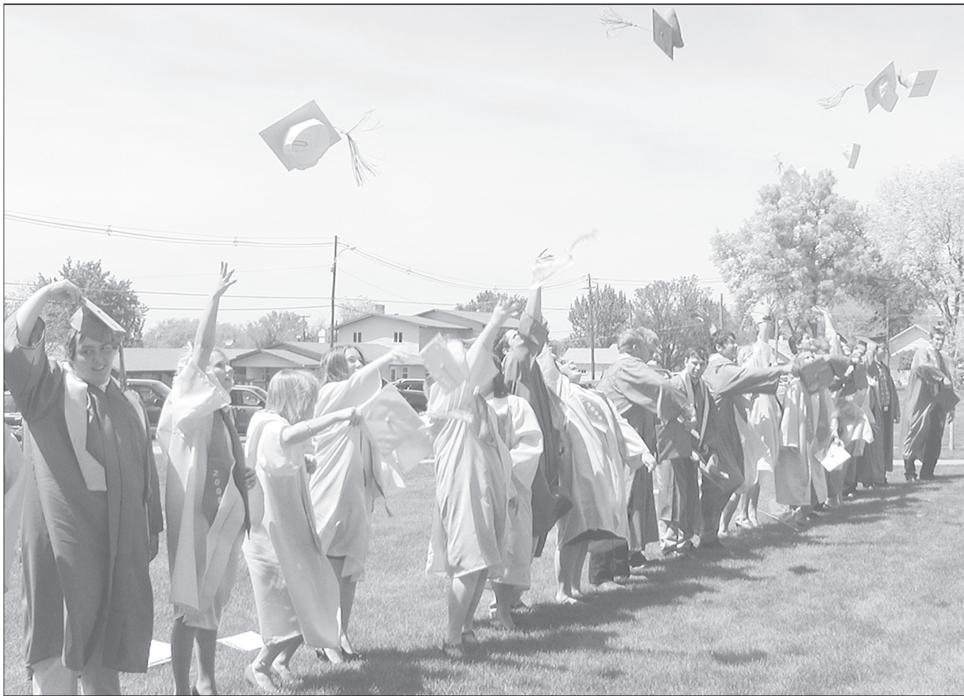
CAPS WERE TOSSED after 30 St. Francis seniors graduated on Sunday afternoon. The weather was pleasant for the traditional toss.